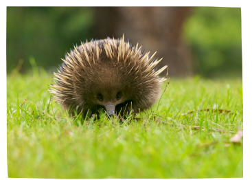
Animal Peg Craft. Find your Animal Friends. Incursion $15

Visiting Zig Zags OSHC today will be a red tailed cockatoo, tawny frogmouth, echidna, woylie, python and more.