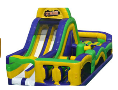
Marble Maze. Obstacle Tag. Incursion $19

There will be challenges galore in the Inflatable Obstacle Course.